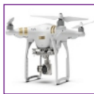
无人机 Drone Aircraft