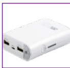
充电宝 Power Bank