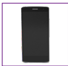
手机 Smart Phone