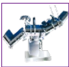
医疗设备 Medical Device